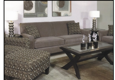
Example of Living Room Furniture