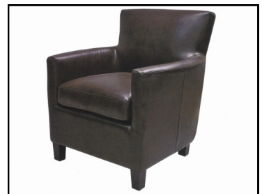
Proposed Occasional Chair for Reception Area and Apartments