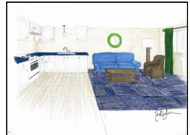
Rendering of a Studio Apartment