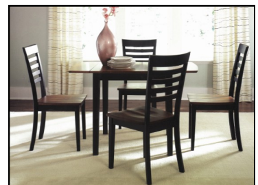
Proposed Dining Table w/Chairs