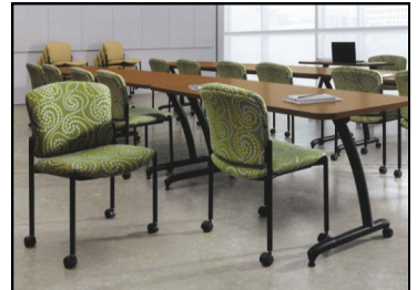
Proposed Multi-purpose Room Furnishings